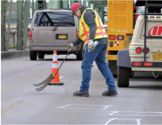
Chain Drag during Lane Closure