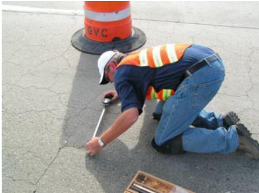
Measuring Crack Spacing